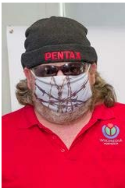
COVID-safe Tech Expo 2020